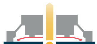
LED above the printed circuit board