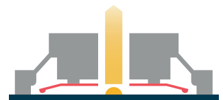
LED below the printed circuit board

Furthermore, the low-noise keypad can also be combined with light chimneys. LEDs can be placed above or below the printed circuit boards. This enables design options with the perfect sound, manageable haptics and lighting .