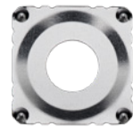
MD 6.2 mm

STC-MD-LN can be used with metal domes with different coatings and ranging from 6.2 mm to 7.2 mm. This allows for many different applications with regard to, e.g. the installation size and the requirements of electrical contacts from < 1 ohm to < 100 ohms.